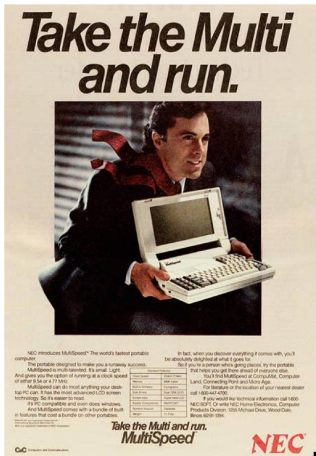
Figure 3.4. An Advertisement Promoting A Portable Computer Produced By NEC. Portable Computer Is One Of The Results Of Innovations That Have An Effect On The Industrial Revolution 3.0