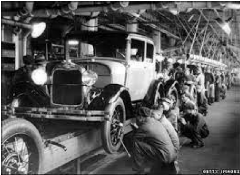
Figure 3.2. Mass production at the Ford car plant Transforming the World's Automotive Industry

companies can buy shares because the mass production system cuts off large injections of funds to grow into large ones as well.