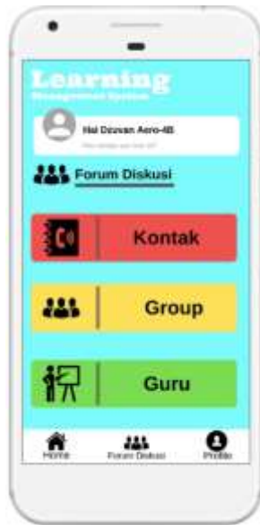
Gambar 6. Forum Diskusi

Pada gambar 6 didesain sebagai forum diskusi bagi siswa yang terkontrol oleh guru. Dan untuk kembali pada menu utama klik button Home.