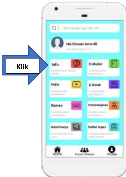
Gambar 5a. Info

Pada Menu akan tersaji pilihan yakni: Info, Video, Games, Galeri Karya, E Modul, E book, Pembelajaran dan Daftar tugas.