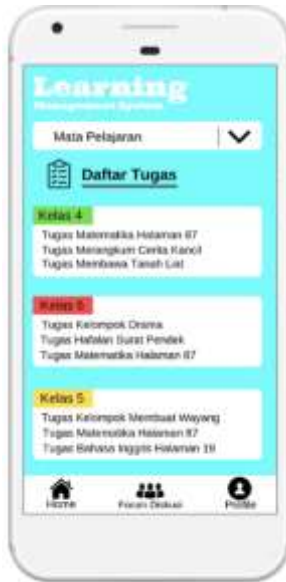
Gambar 5i. Daftar Tugas

Pada gambar 5i didesain sebagai rangkaian tugas yang harus diselesaikan siswa setelah pembelajaran di kelas dan dapat dikerjakan dirumah. Pada penyelesaian daftar tugas ini siswa dapat berinteraksi dengan siswa lain dengan cara klik button pada Forum Diskusi