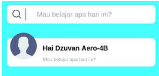
Gambar 4. Sapaan dan minat belajar

Pada gambar 4, siswa dapat mengisi dengan cepat mata pelajaran yang akan dituju pada kolom yang tertulis "Mau belajar apa hari ini" disertai kalimat sapaan nama siswa yang terdaftar saat login.