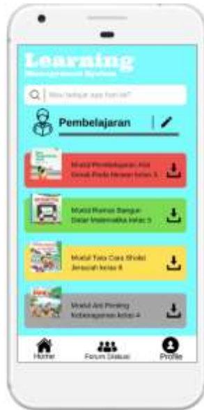
Gambar 5h Pembelajaran

Pada gambar 5h didesain sebagai rangkaian tugas keseluruhan rangkuman pembelajaran yang dapat dipelajari siswa. Dan untuk kembali pada menu utama klik button Home. Selanjutnya siswa dapat memilih klik button Daftar Tugas