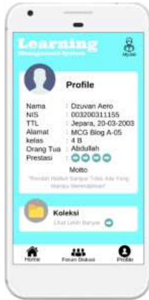
Gambar 7 Profile Siswa

Pada Gambar 7 didesain agar siswa dapat mengisi profilnya sesuai dengan format yang tersaji.