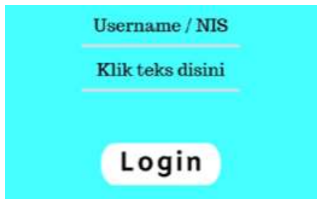
Gambar 2. Intro 2

Pada gambar 2. Akan muncul tulisan User Name, siswa dapat mengisi nama depannya. Dan pada Klik Teks disini dapat dituliskan Nomor Induk Siswa. Selanjutnya Klik Login