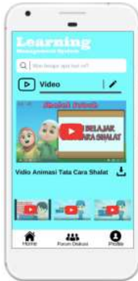
Gambar 5c Aneka Video Pembelajaran

Pada gambar 5 c didesain sebagai video pembelajaran yang sesuai dengan materi yang diajarkan dan untuk kembali pada menu utama button Home. Siswa dapat dapat memilih klik button Games.