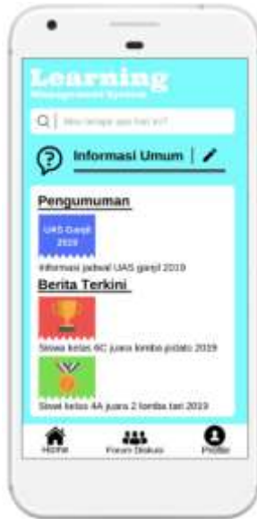
Gambar 5b. Aneka Informasi

Gambar 5b, didesain sebagai aneka informasi dengan Klik button Info maka akan muncul beragam Pengumuman dan berita terkini. dan untuk kembali pada menu utama button Home. Selanjutnya siswa dapat memilih klik button Video akan tersaji tampilan beragam pilihan video yang mendukung pembelajaran