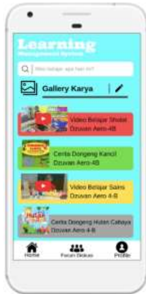
Gambar 5e. Galery Karya

Pada Gambar 5e didesain sebagai gallery karya sehingga siswa dapat mengunggah karya yang telah diselesaikan ataupun sekedar melihat karya dari teman-temannya. Dan untuk kembali pada menu utama klik button Home.Selanjutnya siswa dapat memilih klik button E Modul.