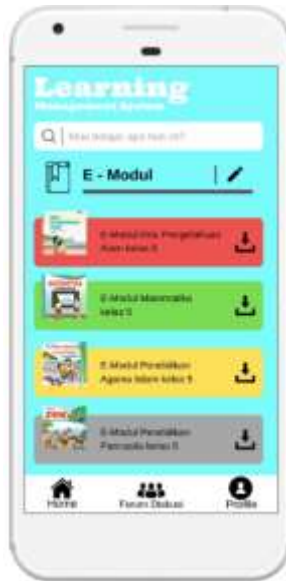
Gambar 5f. E Modul

Gambar 5f didesain sebagai hasil tampilan setelah klik button E Modul. Pada tampilan ini terdapat beragam Modul Pembelajaran yang mendukung materi ajar. Siswa dapat mendownload modul tersebut sesuai dengan tugas yang akan diselesaikan. Dan untuk kembali pada menu utama klik button Home. Selanjutnya siswa dapat memilih klik button E Book.