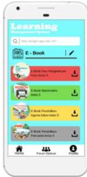
Gambar 5g. E book

Pada gambar 5g didesain sebagai tampilan E book yang menyediakan berbagai sumber buku yang mendukung pembelajaran. Siswa dapat mendownload ataupun hanya membaca buku yang telah disediakan. Dan untuk kembali pada menu utama klik button Home. Selanjutnya siswa dapat memilih lagi dengan klik button Pembelajaran.