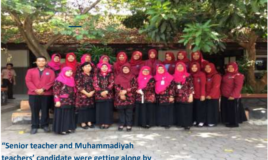
“Senior teacher and Muhammadiyah teachers’ candidate were getting along by taking group photo.”