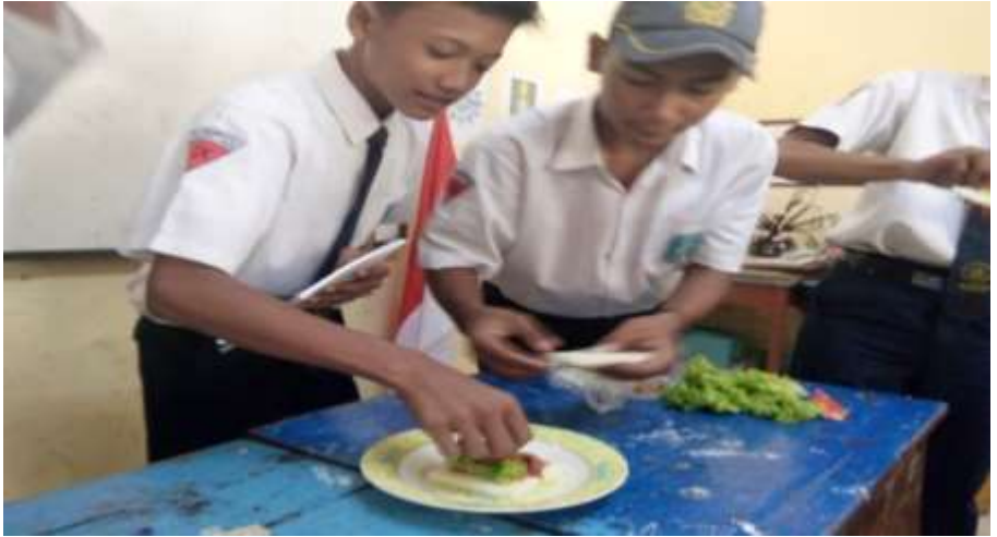
“It’s time for plating.” He said.