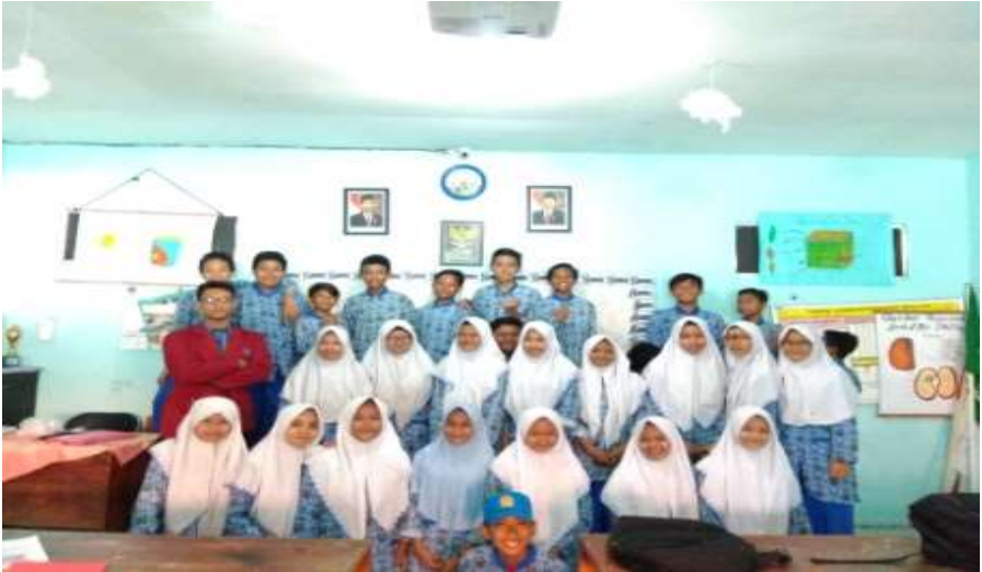
“Teacher and students were formally getting group photo”