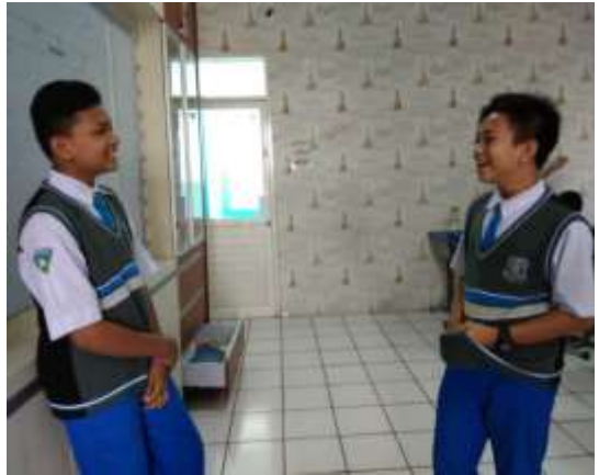
“Students were practicing English conversation in front of the class ”