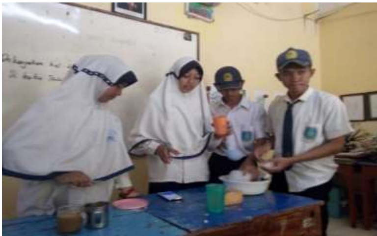
“Students were practicing the procedure text.”