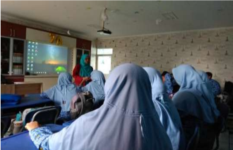
“Teacher conducted the learning process using PowerPoint.”