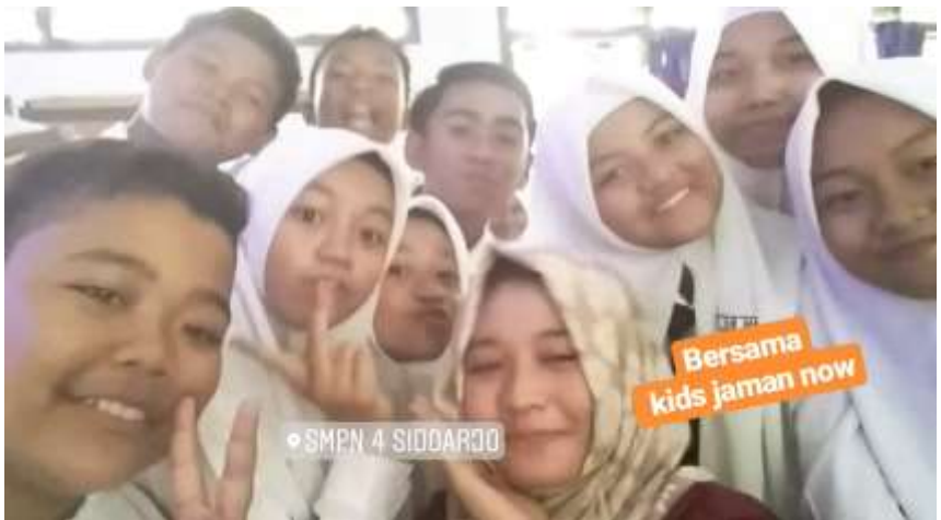
“Wefie with young learners.” She said.