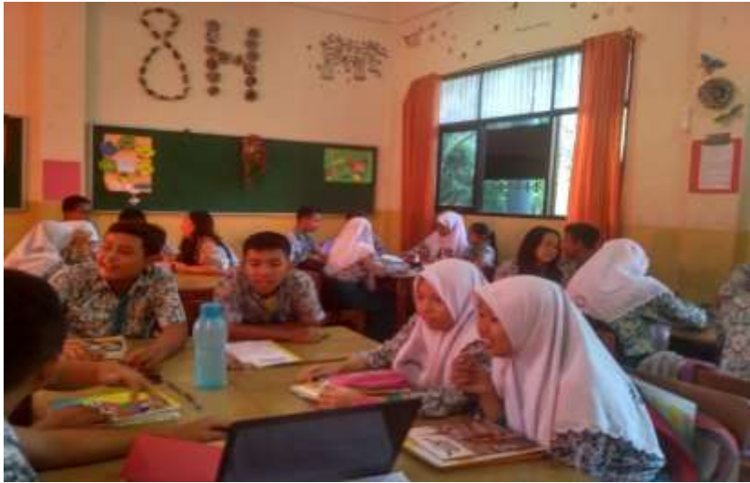
“Students were having discussion time, again.”