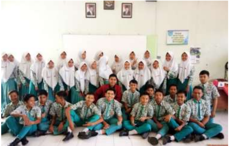
“Me and my students”