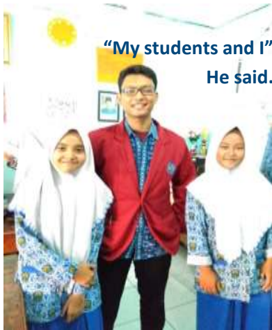
“My students and I” He said.