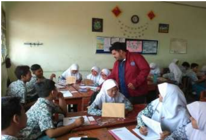
“Teacher were explaining students’ question.”