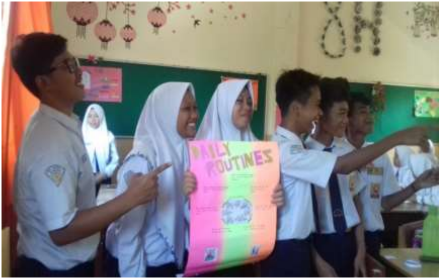
“Having group presentation about daily routine.”