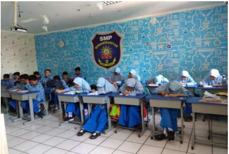
learning process quietly serious”