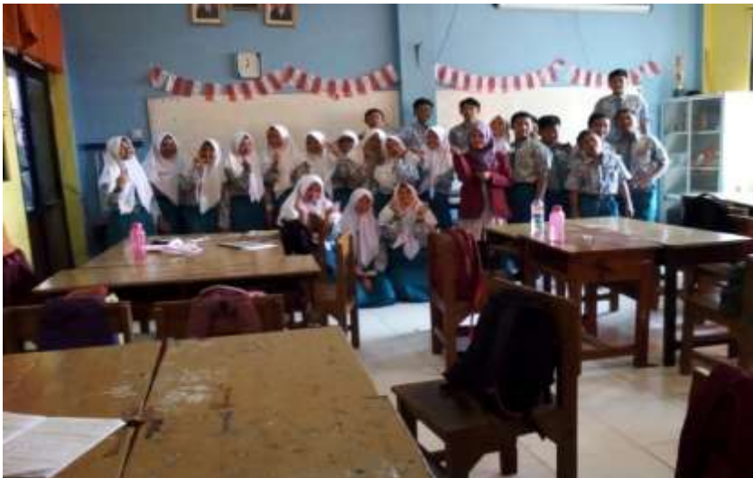
“Having group photo in free time”