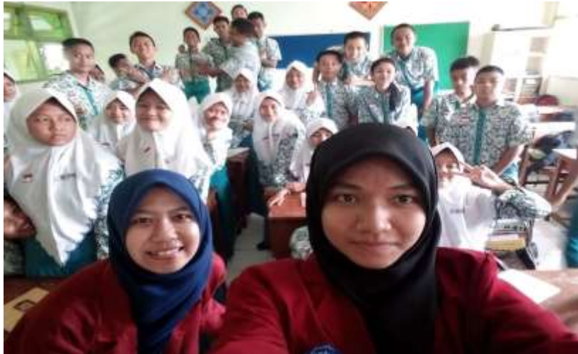
“Teacher and students were having group selfie.”