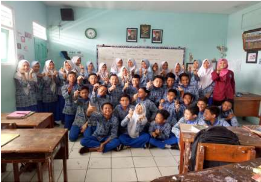
“THUMBS UP!” They shout hysterically.